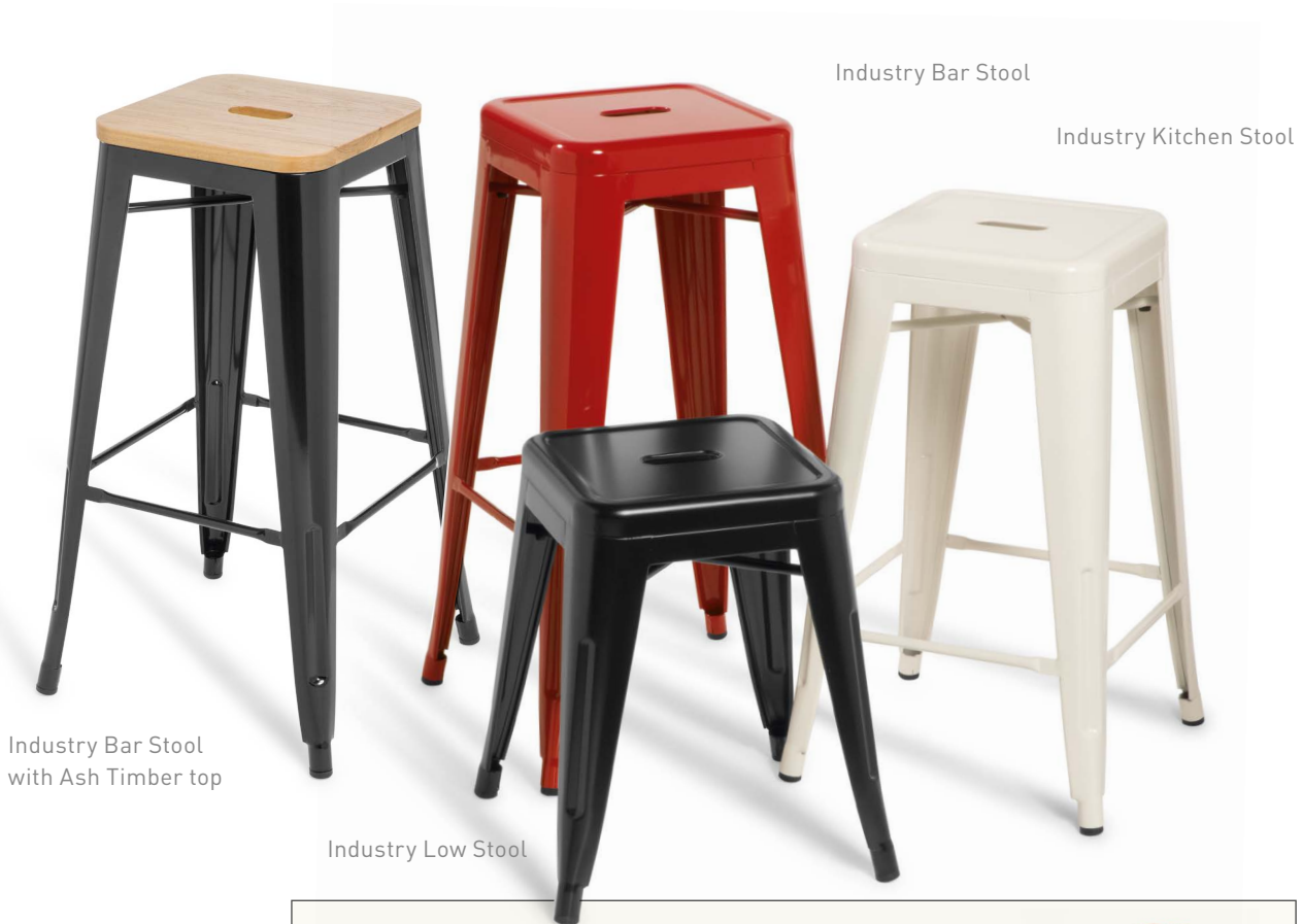
Industry Bar Stool